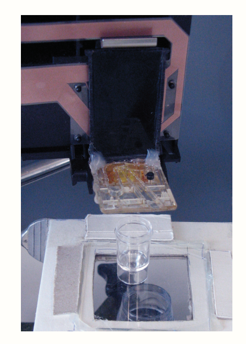
Figure 1: Nozzles of a color cartridge printer head