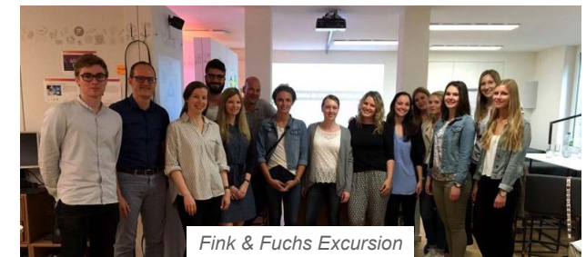
Fink & Fuchs Excursion