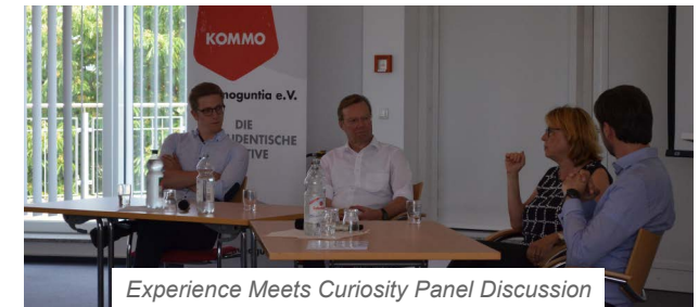
Experience Meets Curiosity Panel Discussion