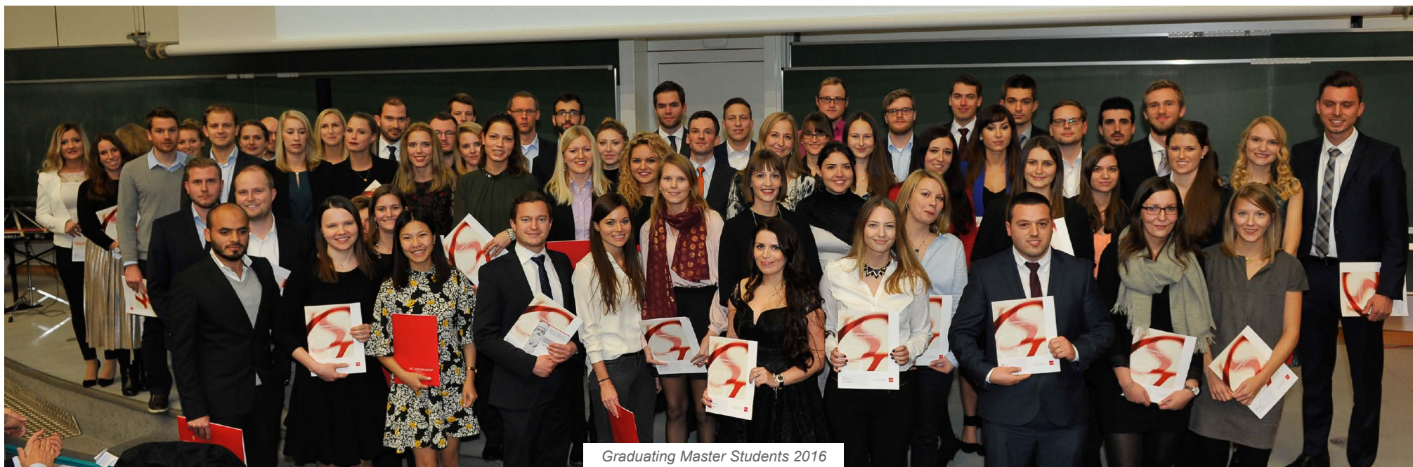
Graduating Master Students 2016