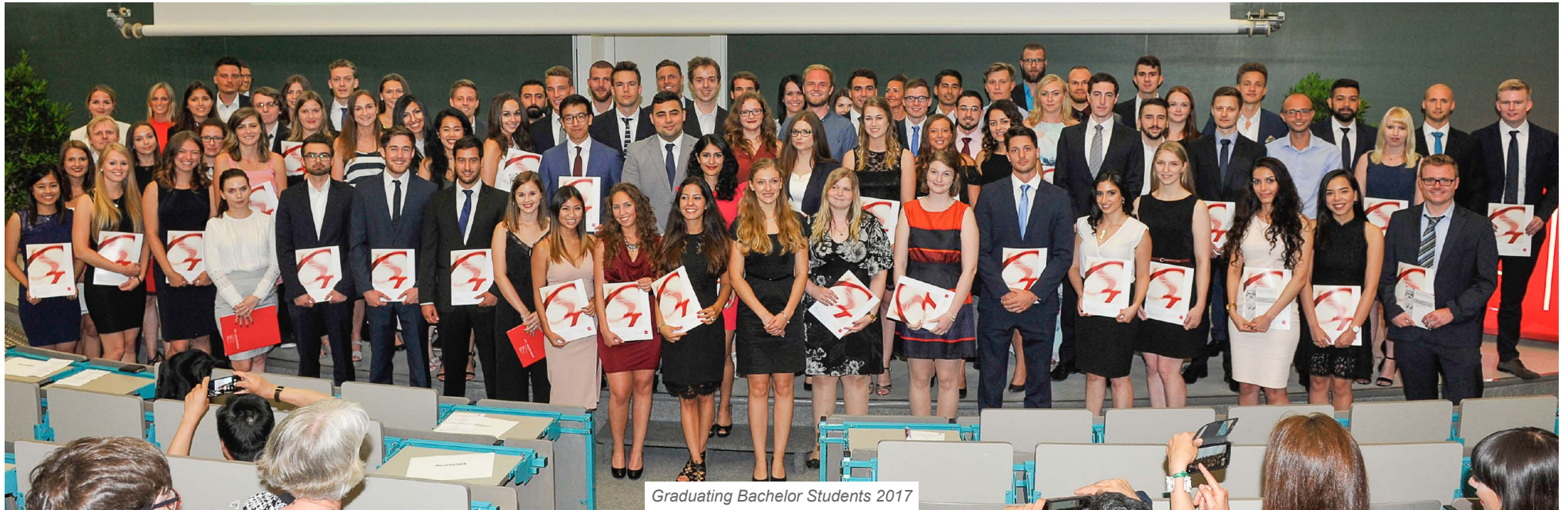
Graduating Bachelor Students 2017