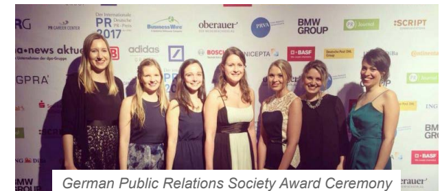
German Public Relations Society Award Ceremony