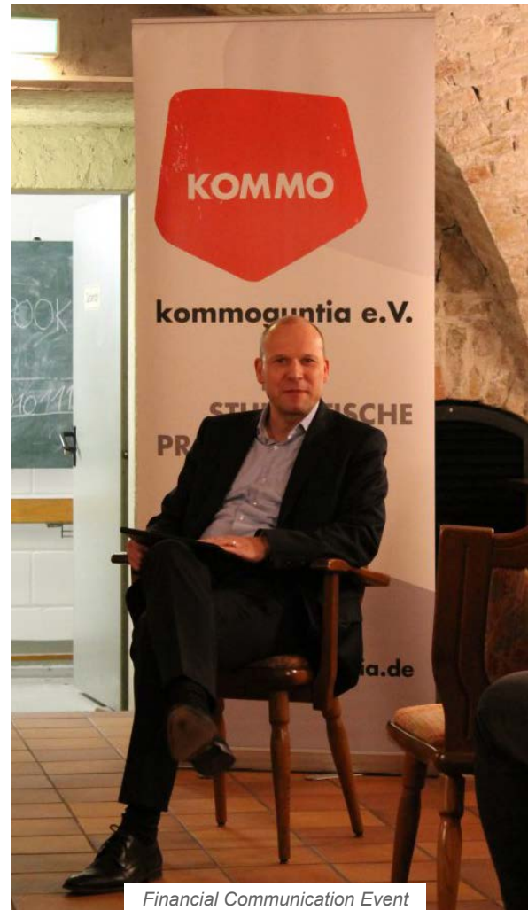
Financial Communication Event

Kommoguntia e.V. is the student PR initiative at JGU Mainz. In cooperation with PR agencies and communication departments of companies, public institutions, associations and NGOs, Kommoguntia e.V. offers exciting workshops, lectures and events. To illustrate just one event of last year, CNC Communications & Network Consulting AG offered a workshop on crisis communication and presented some of their crisis communication cases. The highlight of the workshop was an interactive tool that enabled the students to find themselves in a realistic crisis situation and to act as a communication manager of a fictitious company. Other events included a panel discussion on “Experience meets curiosity” by the German Public Relations Society Award Ceremony, a chat with consultancy Hering Schuppener on “Financial Communication - Between Digital Disruption and Continuity” and an excursion to Fink & Fuchs with discussions on Big Data, artificial intelligence and content marketing. Check www.kommoguntia.de for more information.