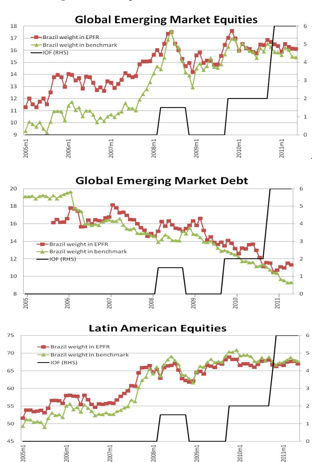
Figure 1: Fund Exposure to Brazil and the IOF Tax

Notes: Brazil weight in EPFR is the average share of the funds portfolio allocated to Brazil. Benchmark is the weight of Brazil in the MSCI benchmark for equities or JPMorgan EMBI Global benchmark for bonds. IOF is the tax on foreign investment in fixed income.