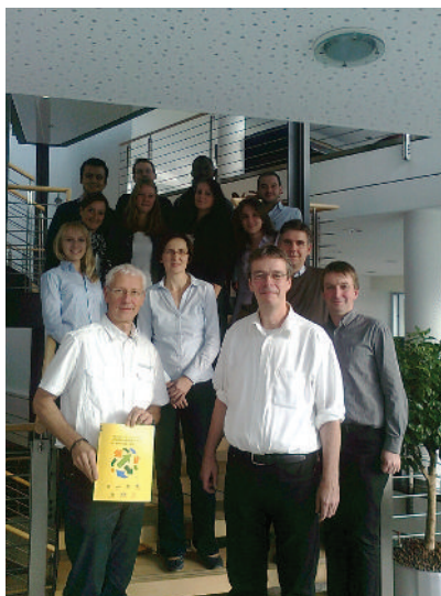
Kick-off meeting in Eltville