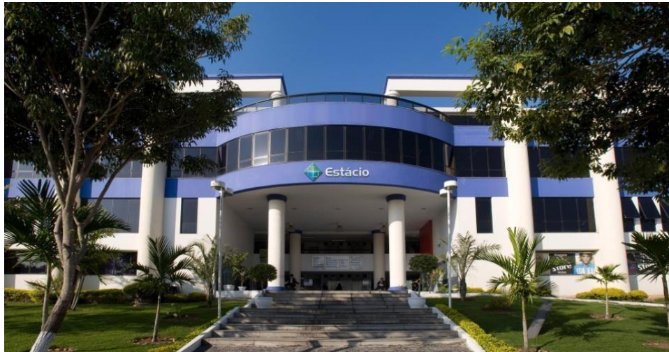
Estácio University, Campus Tom Jobim