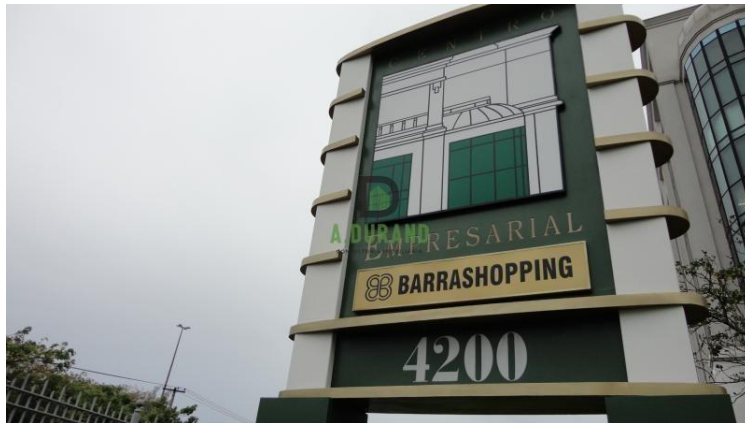
Centro Empresarial Barra Shopping